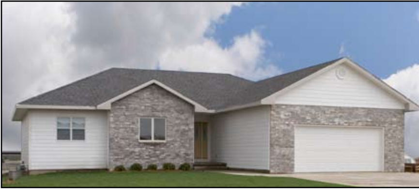
The house above is just one of the homes built by the Flint Hills Technical College Construction Technology program.

Students attending the Construction Technology program at Flint Hills Technical College, Emporia, are building a house from the ground up. By going from the excavation to the roof line, the students get a chance to learn the skills and techniques needed to build a quality home.