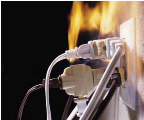
If the wiring is deteriorating or crumbling it can damage its own insulation, putting the system at risk for fire.